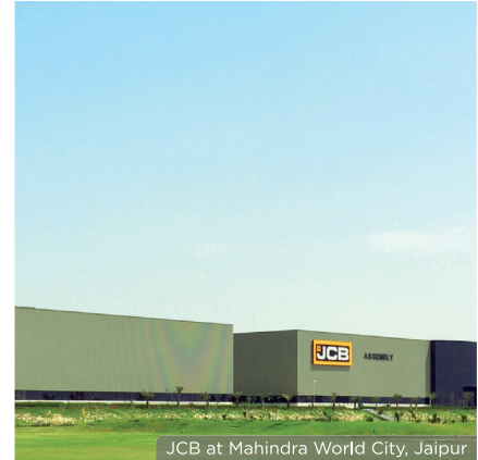
JCB at Mahindra World City, Jaipur