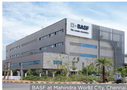
BASF at Mahindra World City, Chennai