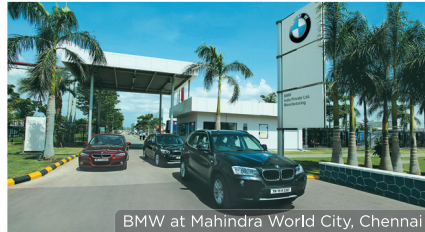
BMW at Mahindra World City, Chennai