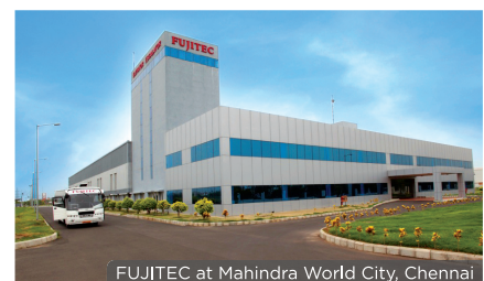
FUJITEC at Mahindra World City, Chennai