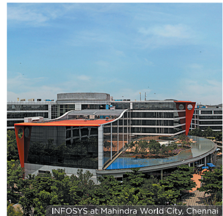
INFOSYS at Mahindra World City, Chennai