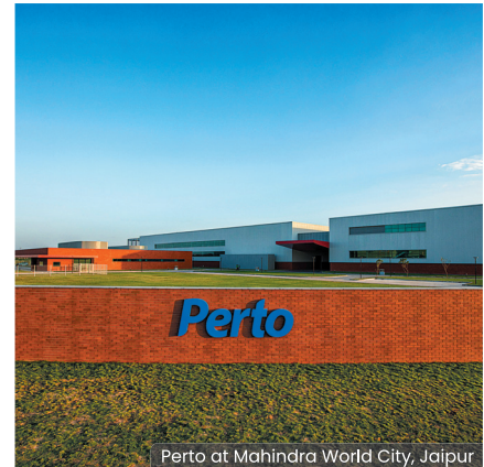
Perto at Mahindra World City, Jaipur